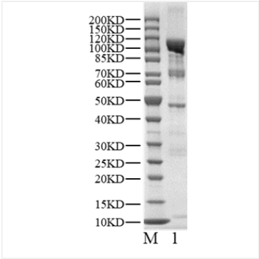
Recombinant Human TTK2 Kinase was resolved with SDS-PAGE under reducing (Lane 1) conditions.