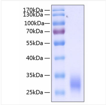
Recombinant Human Fc gamma RIIA/FCGR2A/CD32a (H167R) Protein was determined by SDS-PAGE under reducing conditions with Coomassie Blue.